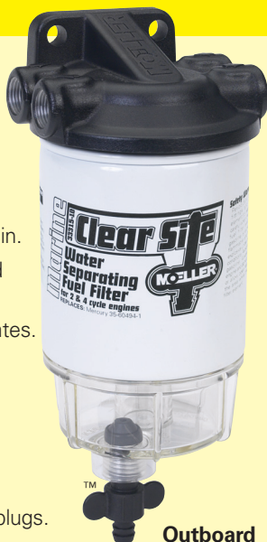
Outboard Part No. 033314-10