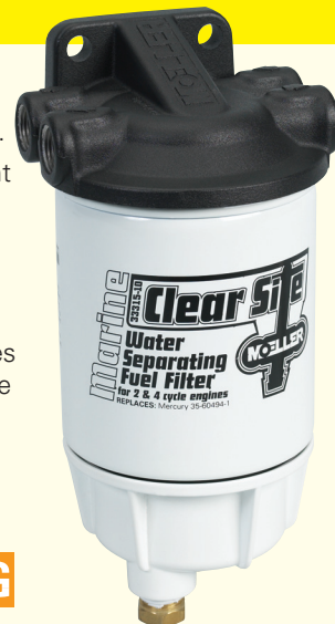
Inboard Part No. 033339-10

*Filter canister will not work with Racor® filter heads