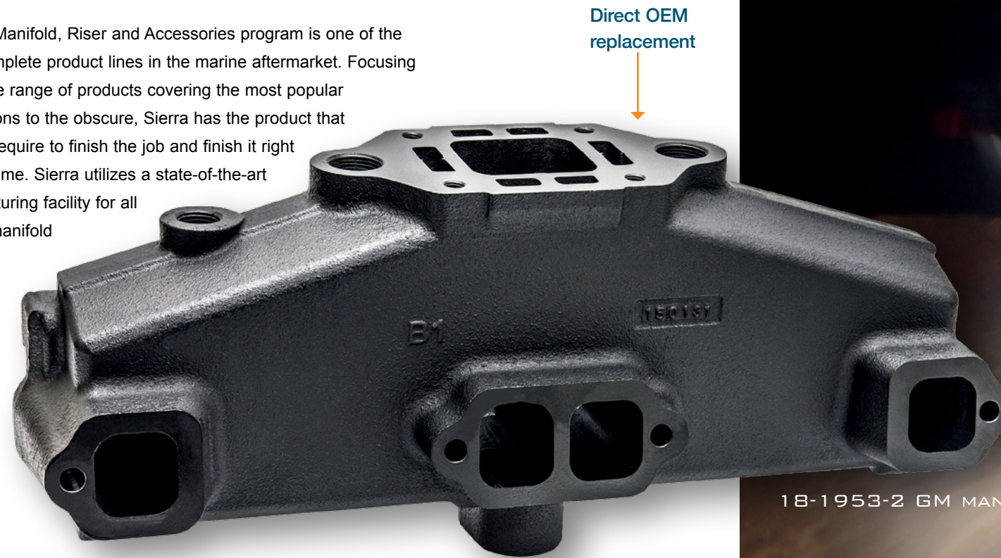
18-1953-2 GM MANIFOLD