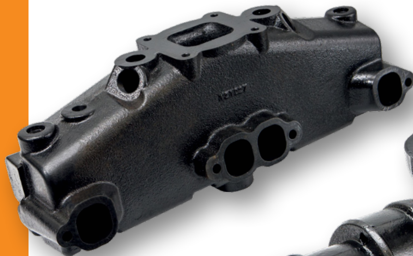
18-1843 - SMALL BLOCK GM DRY-JOINT MANIFOLD

Check out Sierra's full line catalog for a comprehensive listing of manifolds, risers and accessories.