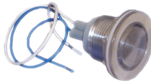
MP42402 Bait Well Light