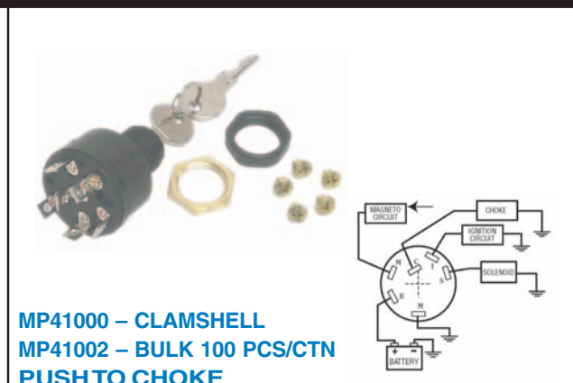
MP41000 – CLAMSHELL MP41002 – BULK 100 PCS/CTN PUSH TO CHOKE