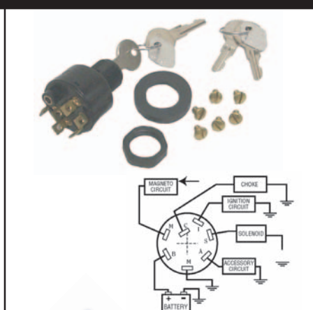
MP41080 – CLAMSHELL MP41082 – BULK 100 PCS/CTN PUSH TO CHOKE