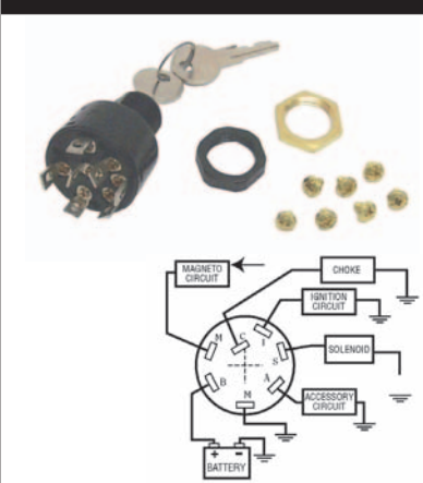
MP41010 – CLAMSHELL MP41012 – BULK 100 PCS/ CTN PUSH TO CHOKE