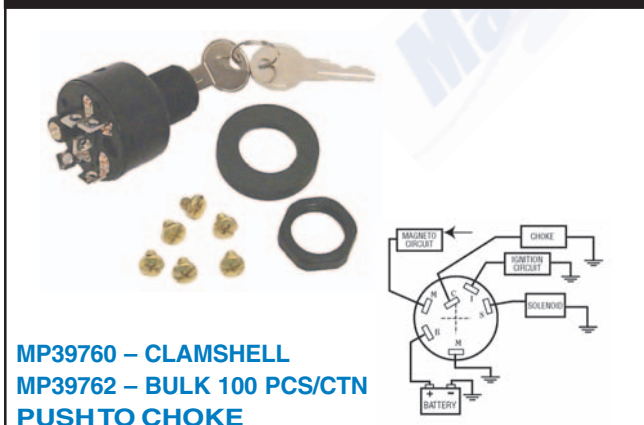
MP39760 – CLAMSHELL MP39762 – BULK 100 PCS/CTN PUSH TO CHOKE